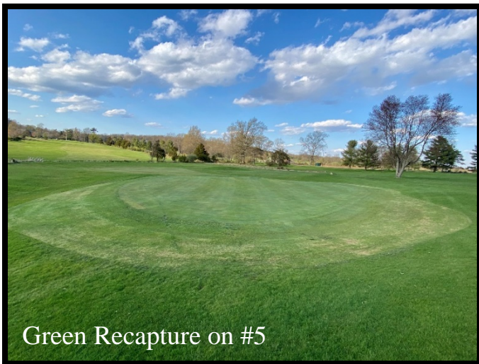
Green Recapture on #5

Our Course Superintendent, Matt Sullivan of Shearon Golf, began course opening preparations in early March. Regular maintenance continues to take place even though we are closed to golfers. Greens and tees have been aerated and seeded and sod has been placed in areas disturbed by the storm drain project on hole 3 and